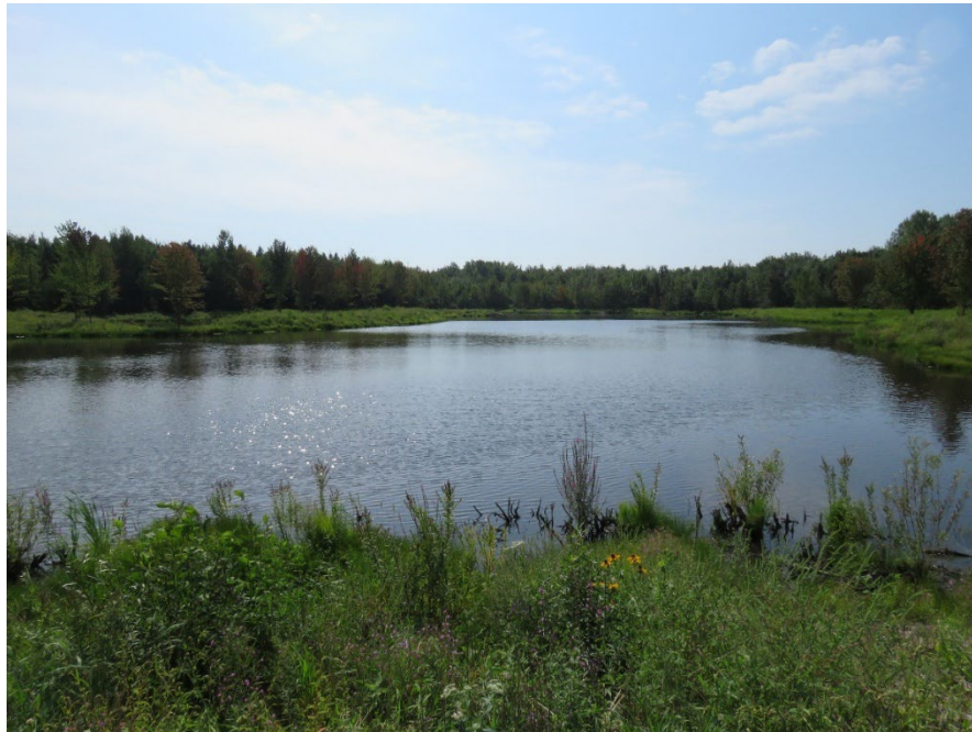
Wetland Restoration SNC 53 Nation Municipality